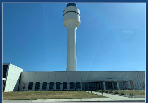
Charlotte Air Traffic Control Tower

This year, OE started working with two new service contracts at the Air Traffic Control Tower at Fayetteville Regional Airport and the brand-new Air Traffic Control Tower in Charlotte, NC as part of the Federal Supply Schedule program with assistance from