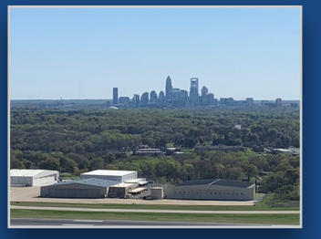
View of downtown Charlotte from the top of the tower

SourceAmerica. The control tower building in Fayetteville is 4,000 square feet with a tower that is four-stories tall. The control tower building in Charlotte is 40,000 square feet with a 14-story tower. That is a lot of space to clean! Staff work seven days a week and three shifts per day providing custodial services at